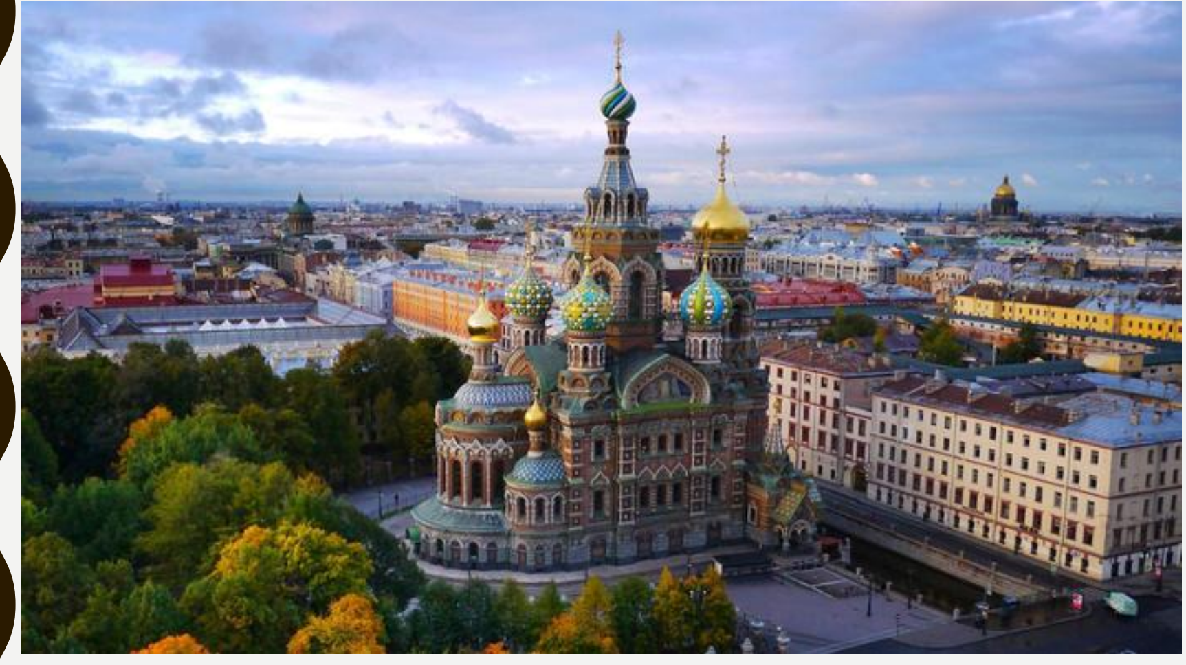
The Church of the Saviour on Spilled Blood